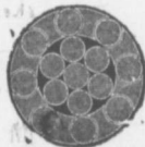
Locked Coil Aerial Cable or Gallery Guide.