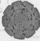
Lang's Lay or ordinary Patent Flattened Strand Winding or Hauling, Patent Flattened Strand, (non spinning)

DRAWERS OF all Sections HIGH CLASS STEEL-WIRE. for Ropes, Springs, Pianos, Needles, Fish-Hooks Binding Armatures and all other Purposes.