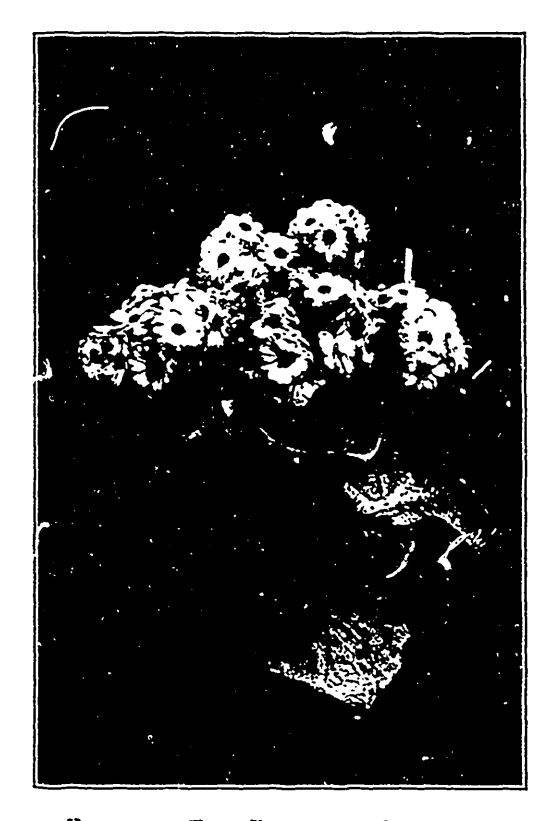
Fig. 2559. TALL BRANCHING CINERARIA.

be given them. Keep them dry until next season in the pots.