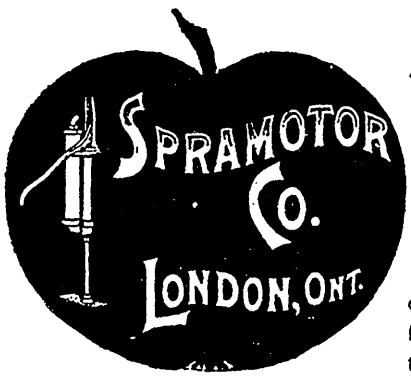
Patented in Canada and United States September 21, 1893; July 17, 1894.