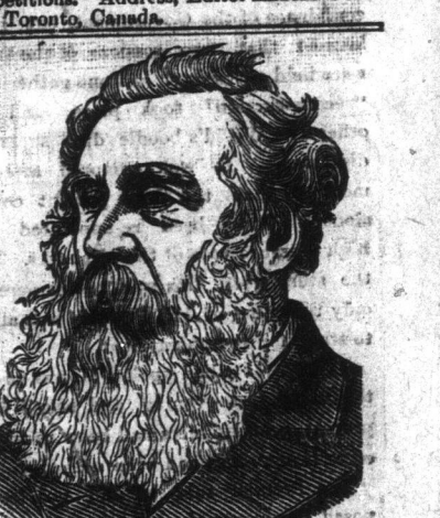
Caption for the portrait of a man.