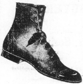
SIZES: 5 to 10.

For Durability and Comfort there is nothing to equal the Cindrella Boot. Every pair is worth from 20 to 50 cents more than the price asked.