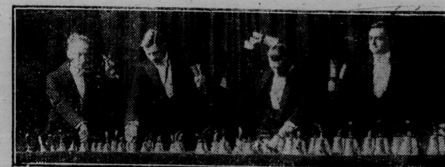
Bell Ringers' Quartette