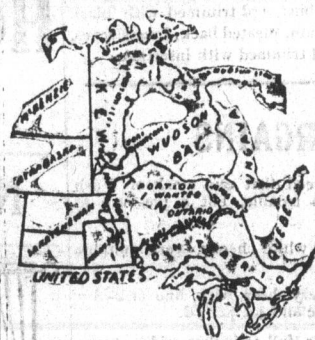
KEEWATIN AS IT MAY BE.

Ontario naturally disputes this very sweeping claim to a very large portion