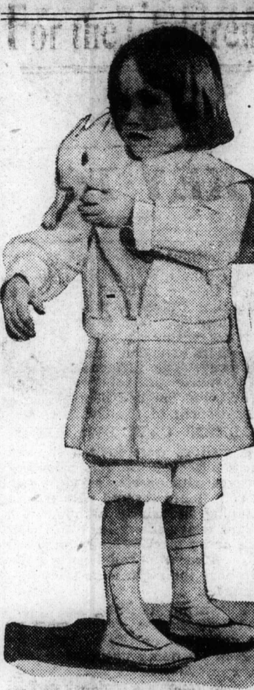
Br'er Fox and the Bunny.

Once upon a time there was a hen who, in order to be exclusive of her friends of the barnyard, built her nest up the road in a thicket under the fence and started in to raise a brood of chicks. Everything worked fine, but one moonlight night there came a sudden stop, for down the road came a fox, nosing from side to side, till all of a sudden he spied in the moonlight in the grass the head of Mother Hen on her eggs. Quick as a flash he grabbed her by the neck and dragged her off the nest, and away up the lane he went. Sooth to say, it looked bad for the eggs in the nest. But up from the barn in the lane came loping along, nosing from side to side, a little brown pup, when suddenly he lighted on the vacant nest. Creeping closer, he took in the situation, the warm nest and nobody home. Instead of destroying them the dear little fellow just placed his warm body on the eggs and took the place of the poor mother, kept them warm all night, and the next morning, which was Easter morn, he brought forth a brood of chicks.