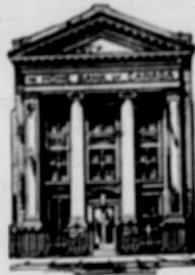
Head Office of the Home Branch of Canada, 8 King Street West, Toronto.

HEAD OFFICE Original Charter 1854 TORONTO