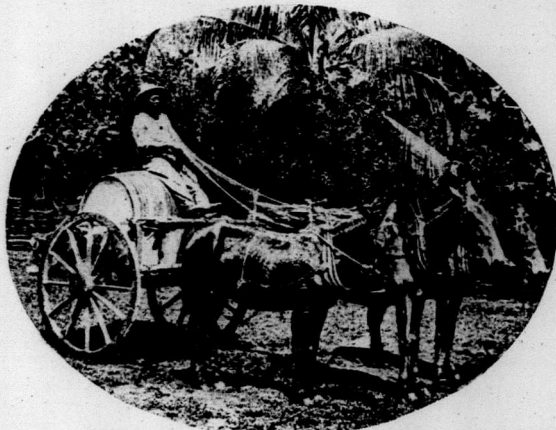
Hauling "Sovereign" Lime Juice from Plantation to Ship.