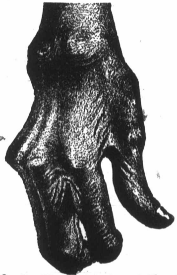
Deformity of the Hands in General, Chronic Articular Rheumatism.

Rheumatism, Lumbago, Sciatica, Pain in the Back have been cured, in the real meaning of the word, by a little Stillingia, Iodide of Potassium, Poke Root, Guaiac Resin and Sarsaparilla. Any person can take these remedies in any reasonable amount with perfect safety, and the results have been found to be astonishing. It has been proven that this combination makes up the best rheumatism remedy in existence, having actually cured many stubborn cases of over 30 and 40 years' standing—even in persons of old age.