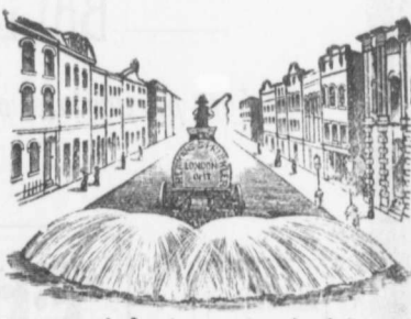
Studebaker Sprinker (PATENT IMPROVED.)

Because no sweeper so effectually does the work for which it is designed as "The Studebaker." It sweeps Clean. No sweeper is constructed with the same degree of care and mechanical precision. It wears well. "The Studebaker" has the smallest number of working parts, and has less gearing than any other sweeper made. It is free from all unnecessary complications. With a reasonable care it does not get out of order. Send for complete descriptive catalogue.