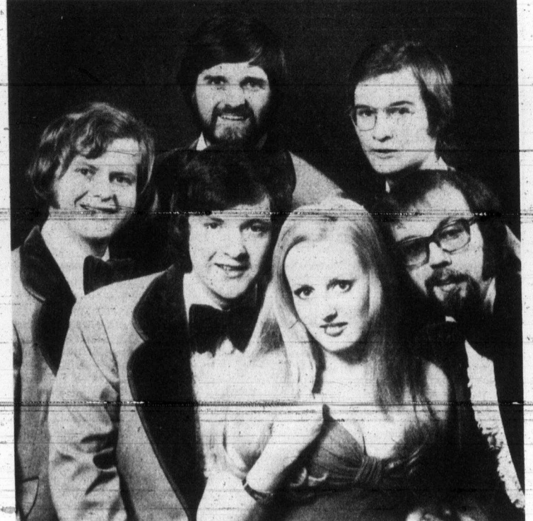
Adam's Rib on the Queensway, has been bringing in some fine entertainment to the area. This group is no exception to the rule. They are called Winchester Cathedral, and are directly from England. They will open this coming Monday evening at Adam's Rib Steak House and Tavern.