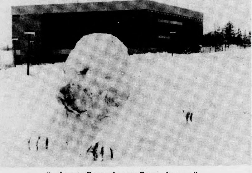
"...I am in Egypt, I am in Egypt, I am...."

And, if deficit financing doesn't work, will the government bail us out? Apparently not.