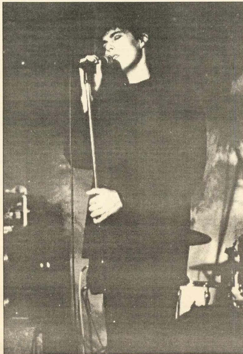
A small crowd found this Toronto artist worth the wait.