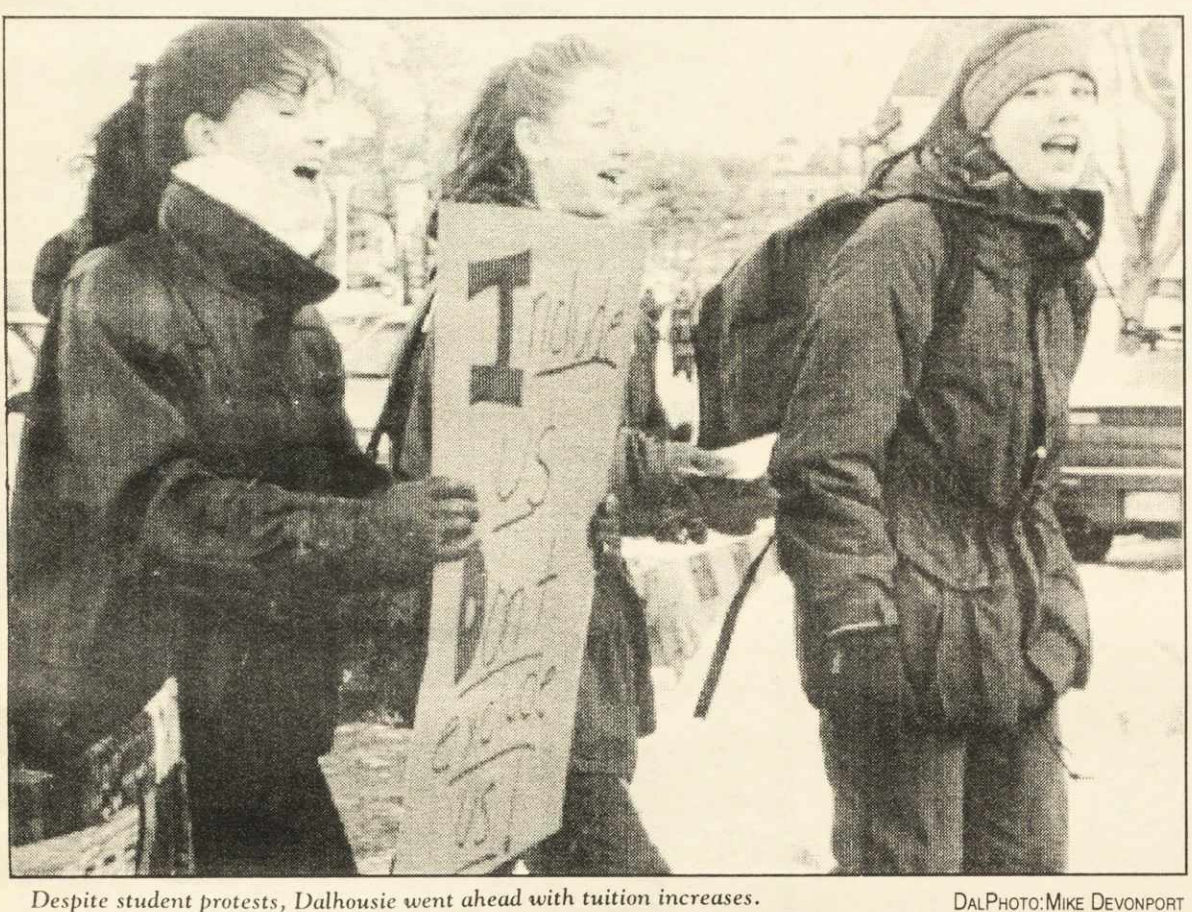
Despite student protests, Dalhousie went ahead with tuition increases.

The only surprise was that nine members voted against raising tuition fees instead the usual four or five.