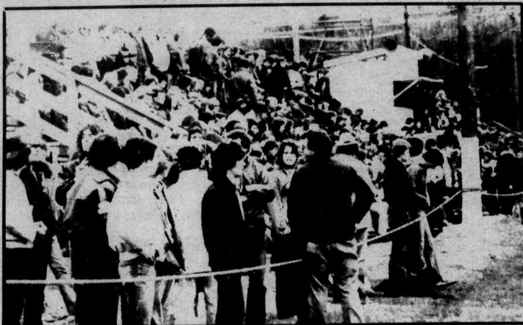
This many UNB students can't be wrong. Go to a UNB sporting event soon!

Read the Bruns for further Bloomers news.