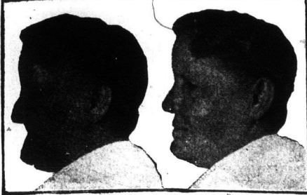
THE WRONG and THE RIGHT

Many writers of note will contribute to our December number. In matter and illustration, it will be of surprising merit. Send a copy to your friend abroad, and, by the way, when you come to think of Christmas gifts, may we suggest that nothing can be more appropriate and acceptable than a year's subscription to The Western Home Monthly.