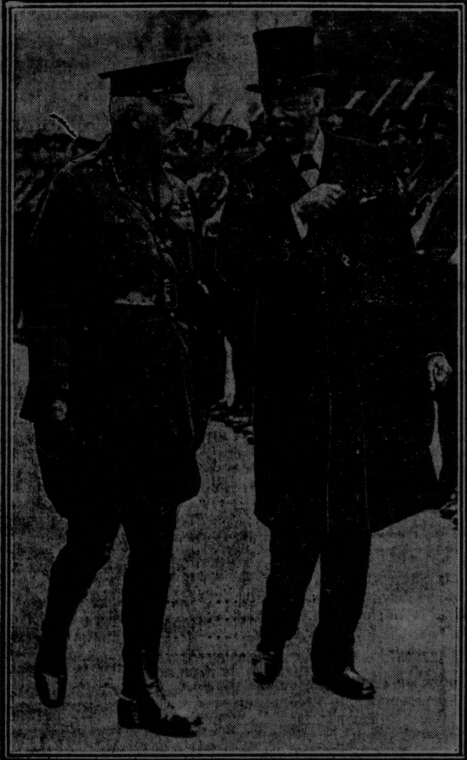
Wars may come and go—but Mr. Balfour, the genial and dignified First Lord of the Admiralty, and virtual leader of the Unionists of England, maintains his placid, well dressed appearance. This is a new photo of him, with one of the English generals.