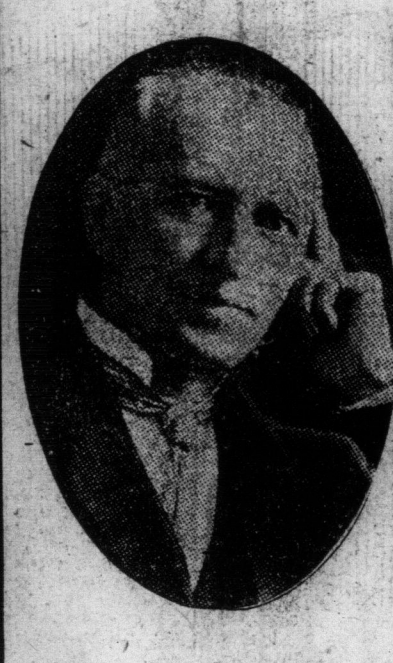
Hon, A. L. Sifton, Minister of Public Works.

p ime minister and Sir George Foster had returned to Canada be-fore the final draft of the treaty was concluded