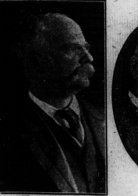
Hon. C. J. Doherty, Minister of Justice.