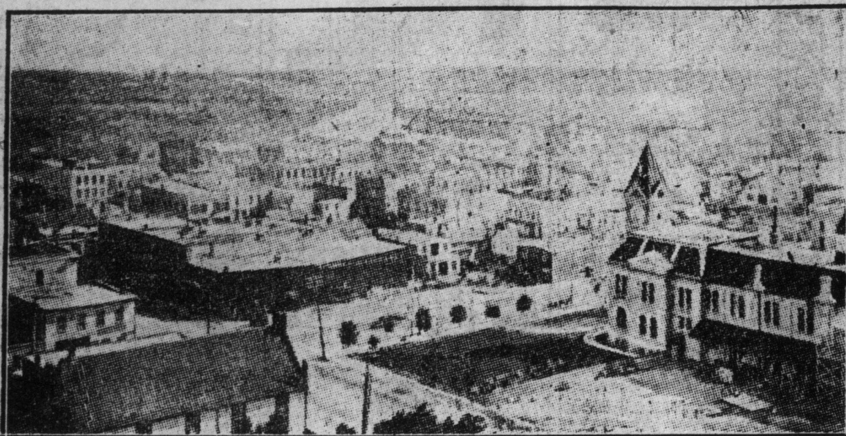
GENERAL VIEW OF THE CITY OF BRANDON

"Every person who invests in well-selected real estate in a growing city, in a prosperous community, adopts the surest and safest method of becoming independent, for real estate is the basis of all wealth." —Ex-President Roosevelt.