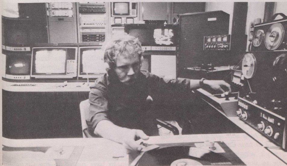
A technician at work in one of the control rooms.

In addition to the operation of the Mont Ste-Marie centre, Cantrakon acts in an advisory capacity for other centres or future centres. Cantrakon will even take full charge of the construction of facilities from the planning stage to completion if a client so desires.