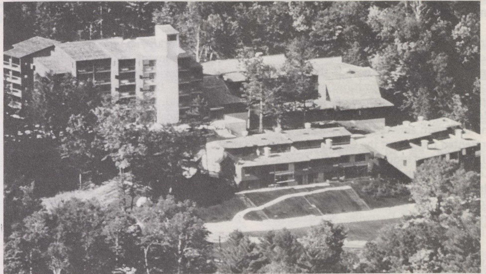
The luxurious inn L'Abri and the Cantrakon training centre. The jointly-owned living quarters are in the foreground.

In the technical centre, the staff is available at all times to provide monitor screens, videocopiers and equipment required for broadcasting tape recordings in