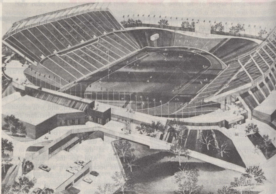
Commonwealth Stadium infield has a 400-metre artificial track with a 36.5-metre radius. All field events will be held on natural grass. The stadium can seat 42,400 with capacity to expand to 52,000.

Who can forget that final climactic lap? Landy was still in front, but Bannister was now close on his heels. Then, suddenly he was ahead, smashing the tape in 3:58.8 minutes, with Landy right behind him in 3:59.6. For the first time, two men had broken the four-minute barrier in the same race.