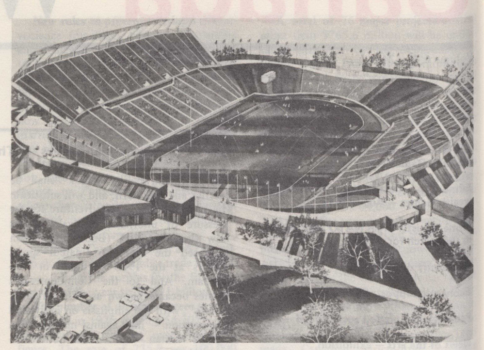
Commonwealth Stadium infield has a 400-metre artificial track with a 36.5-metre radius. All field events will be held on natural grass. The stadium can seat 42,400 with capacity to expand to 52,000.

Who can forget that final climactic lap? Landy was still in front, but Bannister was now close on his heels. Then, suddenly he was ahead, smashing the tape in 3:58.8 minutes, with Landy right behind him in 3:59.6. For the first time, two men had broken the four-minute barrier in the same race.