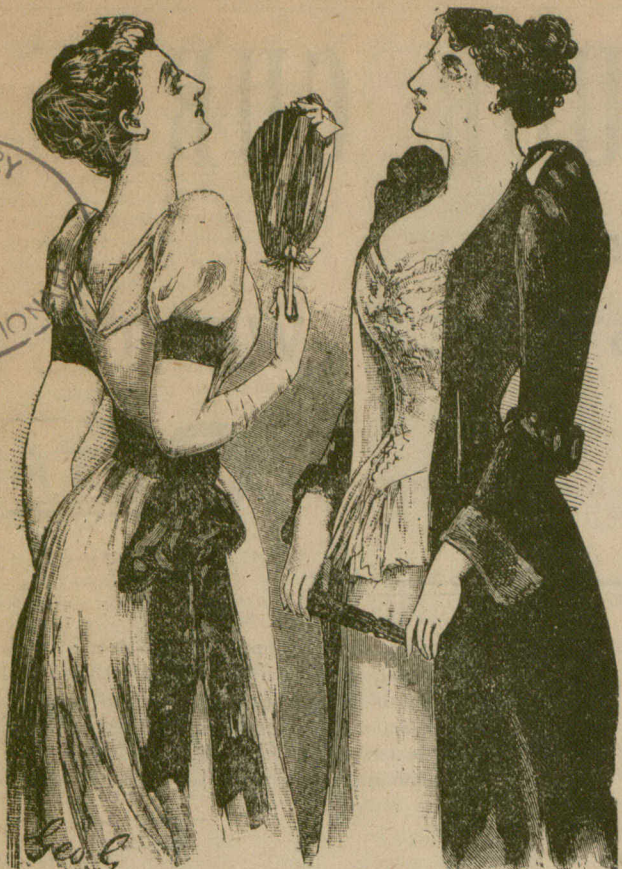
APPORTIONING THE BLAME.

HILDA.—“Did you see Charlie Dashwood drive off with that nasty little Symperson girl?” GEORGIE.—“Yes; and he told me only half an hour ago that he'd have been delighted to see me home, only you'd bored him into promising to take you.” HILDA.—“Why, he said just the same to me about you!” GEORGIE.—“There! I always did detest that Lottie Symperson?”