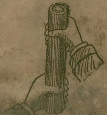
Book closed up.