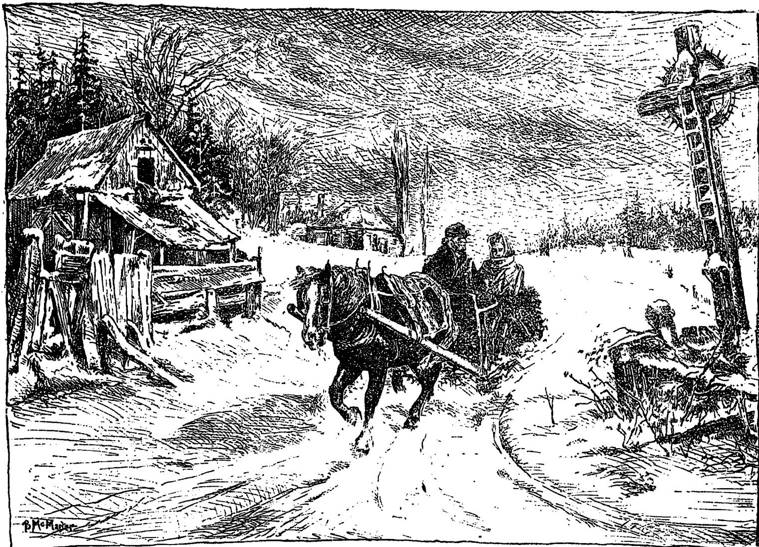
THE CROSS BY THE WAYSIDE.