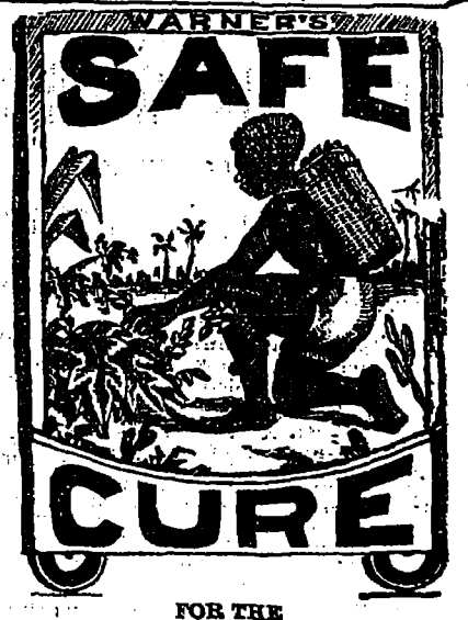
FOR THE KIDNEYS, LIVER & URINARY ORGANS THE BEST BLOOD PURIFIER.

WHILE the silvery harp-note blending, Lead the music to the strain, And from forth the gates of heaven, Gently fall the rains again.