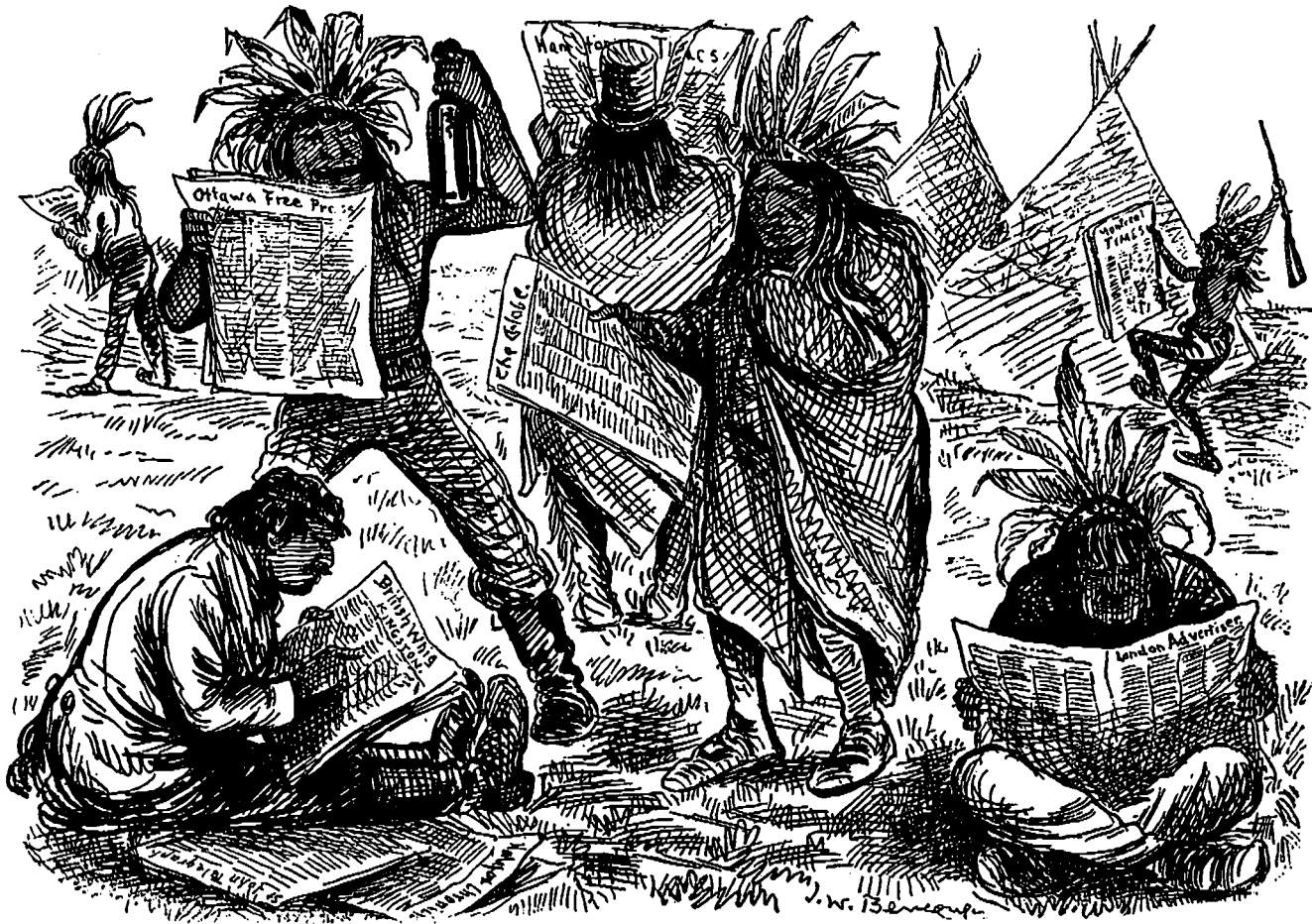
IT IS ALLEGED THAT THE GRIT PAPERS ARE INCITING THE INDIANS AND HALF-BREDS TO FURTHER VIOLENCE.

BRUCE BROS. THE LUMBER MERCHANTS AND BUILDERS. Save Notice by being your own Landlord. Houses built quickly and on easy terms. Call and see us. Corner Berkeley and Front Streets, TORONTO.