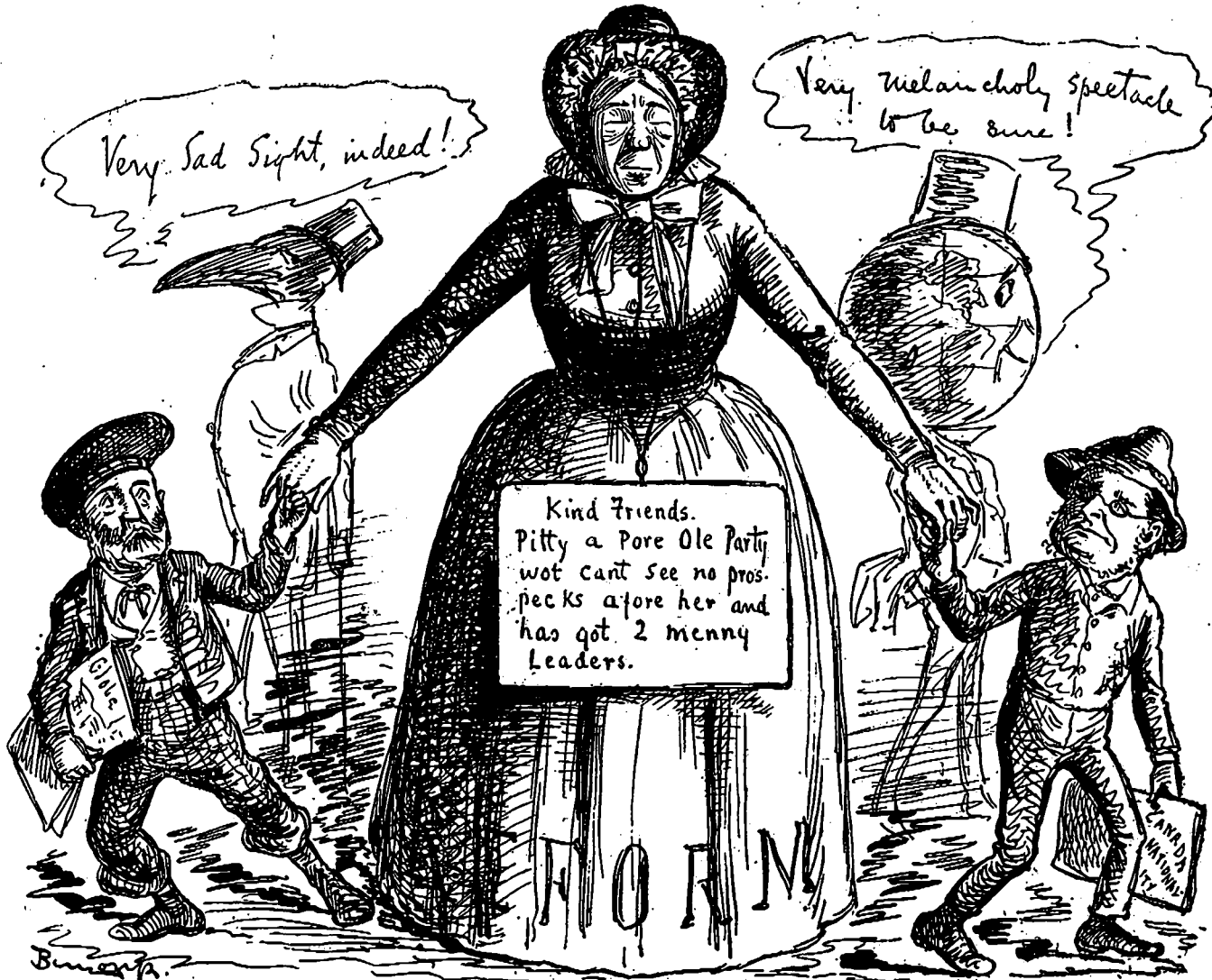
WHICH IS THE LEADER AND WHICH THE WAY ?

CINGALESE HAIR RESTORER! IT PREVENTS THE HAIR FROM FALLING OUT. REMOVES DANDRUFF, AND PRODUCES A BEAUTIFUL HEAD OF HAIR. ALL THE LADIES SPEAK HIGHLY OF IT.