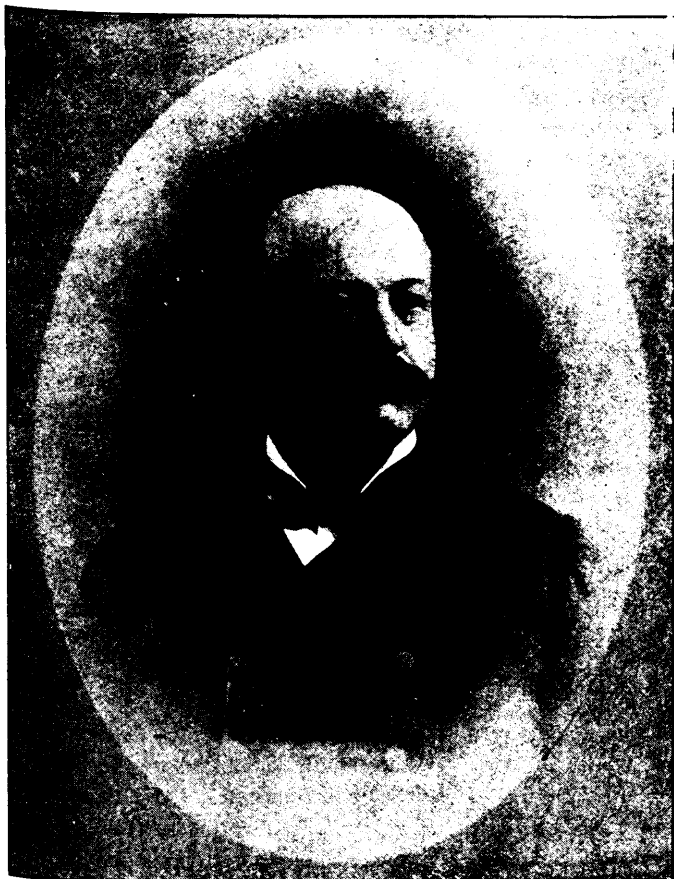
THE HON. ALEX. LACOSTE, Senator.

$4.00 PER ANNUM. IN GREAT BRITAIN, 21s. 8D. 10 CENTS PER COPY. " " 8D. 5D.