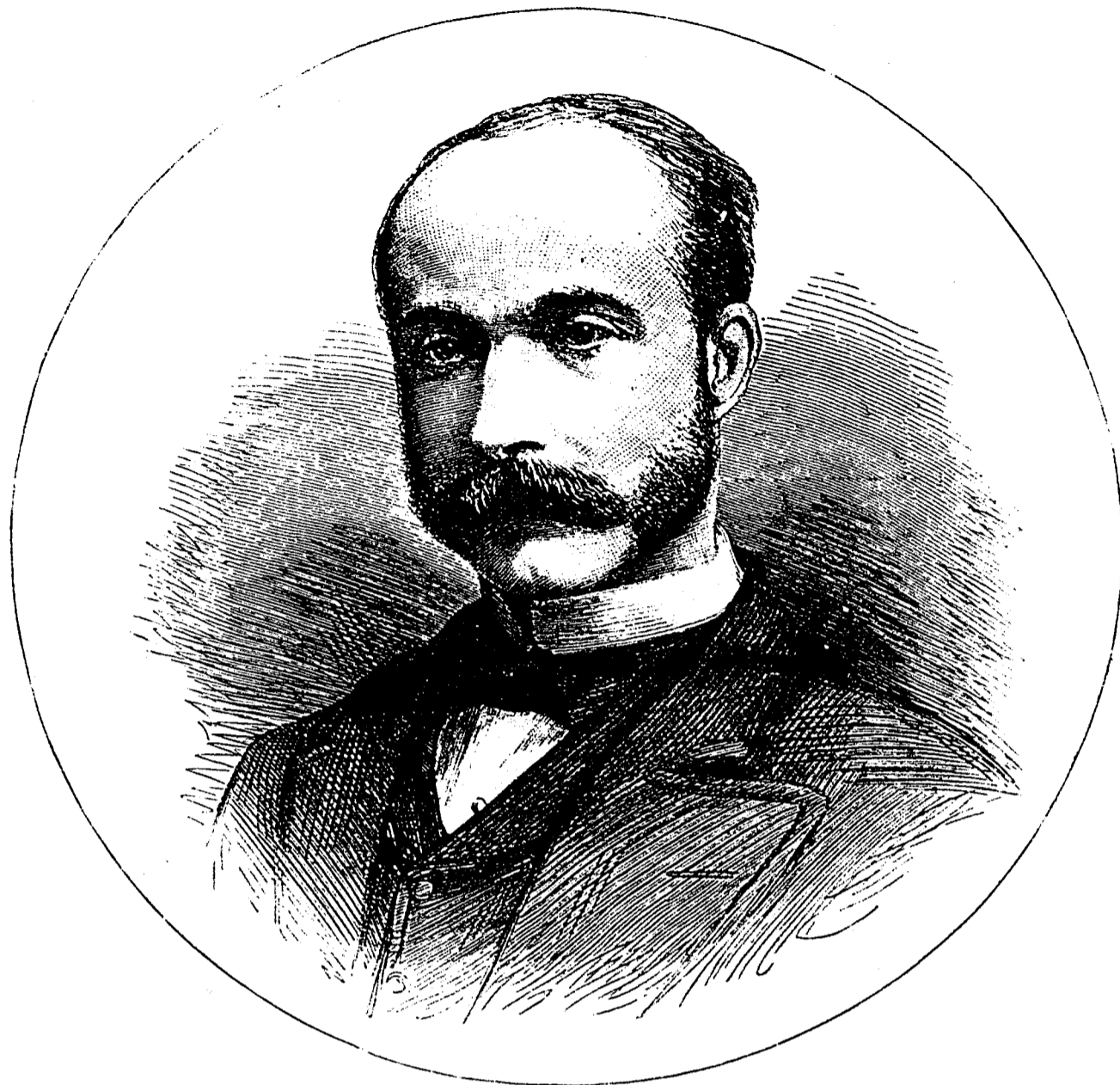
THE MARQUIS OF LANSDOWNE, GOVERNOR GENERAL DESIGNATE OF CANADA.