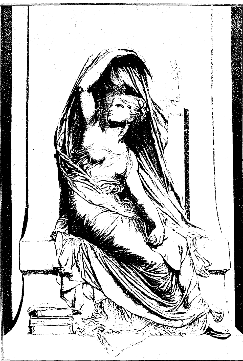
LA PENSÉE.—FROM THE MARBLE STATUE BY CHAPEL.

THE COOK'S FRIEND SAVES TIME, IT SAVES TEMPER, IT SAVES MONEY. For sale by storekeepers throughout the Dominion, and wholesale by the manufacturer. W. D. McLAREN, UNION MILLS, 17-19-52-382 55 College Street.