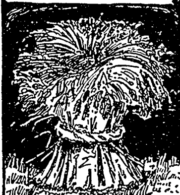
THE REWARD OF TOIL.

SEMI-MONTHLY MAGAZINE * DEVOTED TO THE * FARM AND GARDEN STOCK-POULTRY * * ORCHARD-APIARY * * GRANGE-DAIRY-HOME-CIRCLE.