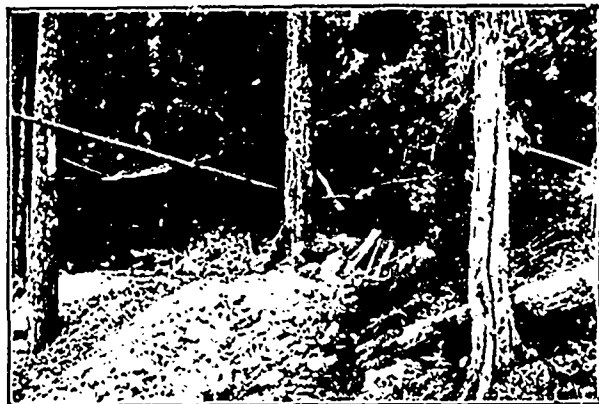
View of the Happy John mine, Alberni District.

of tunnelling has been done and good ore has been met with in both tunnels. This property adjoins the