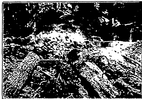
Prospect Shaft at the Cascade mine, Alberni District.

has been driven, but they expect to drive another 25