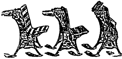
THE "MARVEL" SCHOOL DESK, PATENTED JANUARY 14TH, 1886.

W. STAHL-SCHMIDT & CO., PRESTON, ONTARIO, Manufacturers of Office, School, Church, and Lodge Furniture.