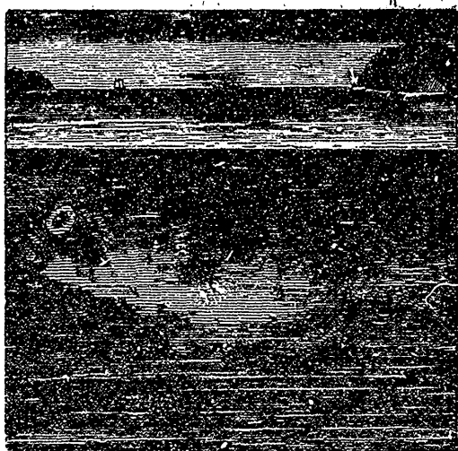
FIG. 10.—SEA PORCUPINE.

The diodon or sea porcupine, shown in Fig. 10, is covered with a leathery skin, which is armed with short erectile spines. It