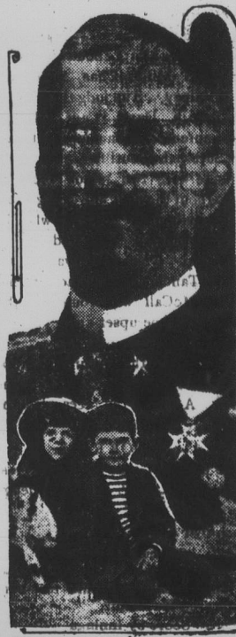
KING VICTOR EMANUEL of Italy and two of his children. The little prince is heir to the throne although he has an older sister.