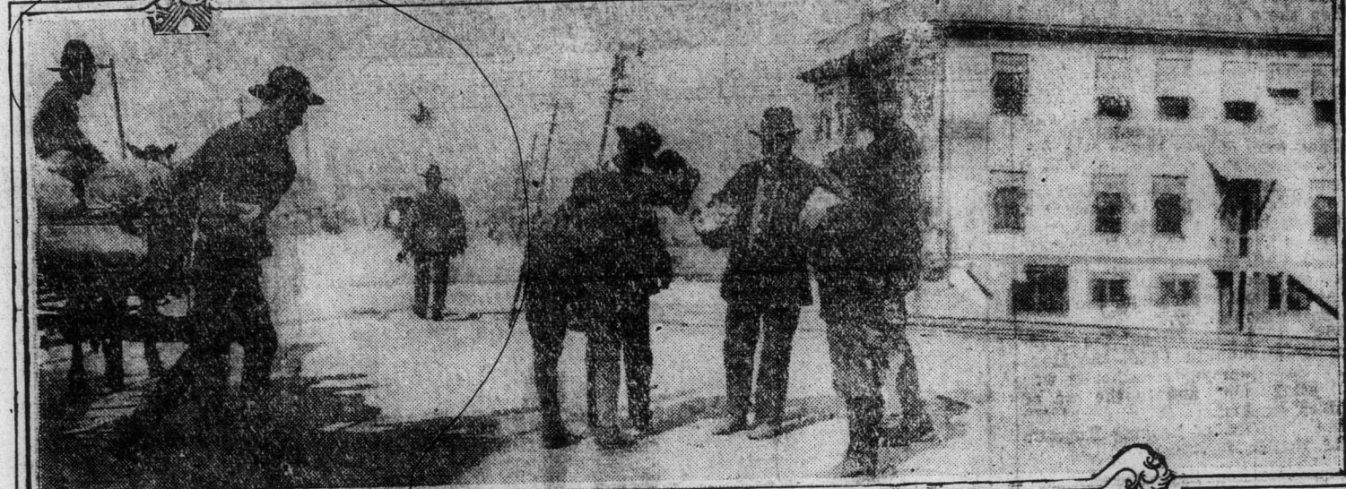
SEARCHING SUSPECTED SPIES IN EL PASO, TEXAS.

One of the above pictures shows American troops searching suspected Mexicans in El Paso, the American border town which has witnessed great excitement since the calling out of the National Guard. The other scene shows the International Bridge, which is now being guarded by a heavy patrol of United States infantry.