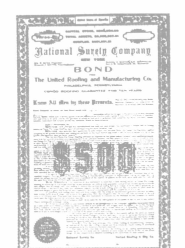
Fac-Simile of Guarantee Bond,

Miller-Morse Hardware Co., Winnipeg; and E. G. Prior & Co., Ltd., Victoria, Agents