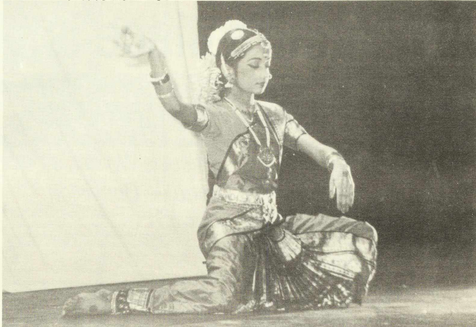
Traditional Indian dance.