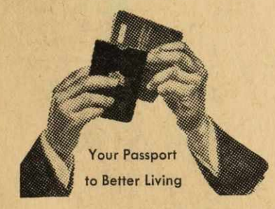
*The Bank where Students' accounts are warmly welcomed.

... and a Savings Account at the Bank of Montreal* is the way to guarantee yourself that secure feeling . . .