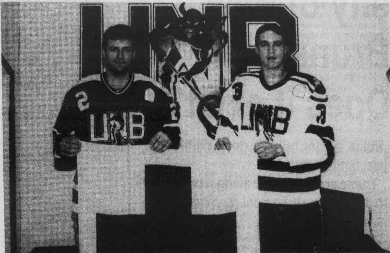
Red Cross blood donor clinic at UNB

Another game between Mt. Allison and St. Mary's is planned for Saturday, with an increase of security personnel.