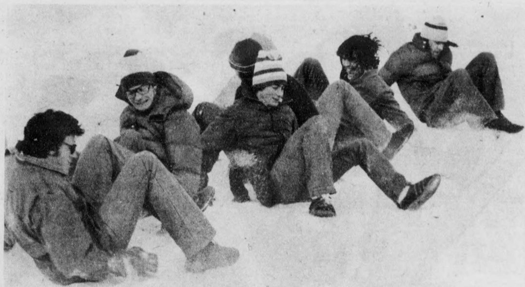
Students having some good old fashioned fun ..... a crab race?