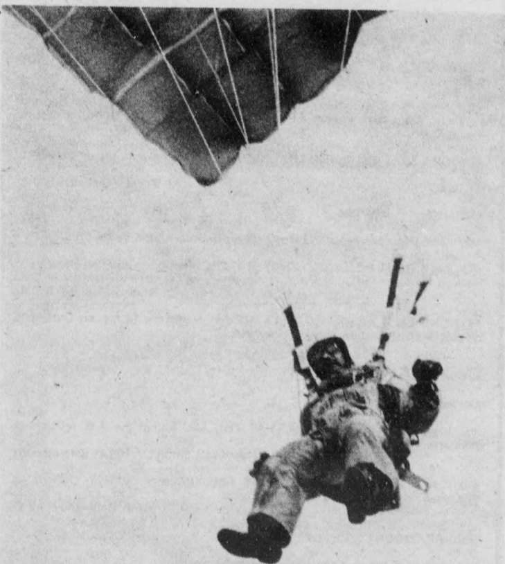
Participant in the Parajumping demonstration comes in for a landing.

The only major damages which occurred during Winter Carnival