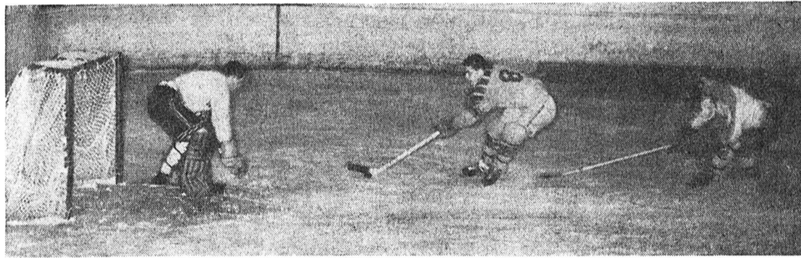
HE SHOTS—DOES HE SCORE?