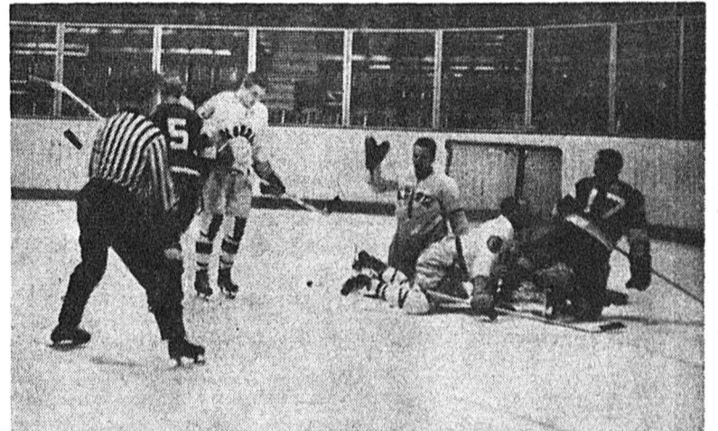
I AM A PARTY POOPER