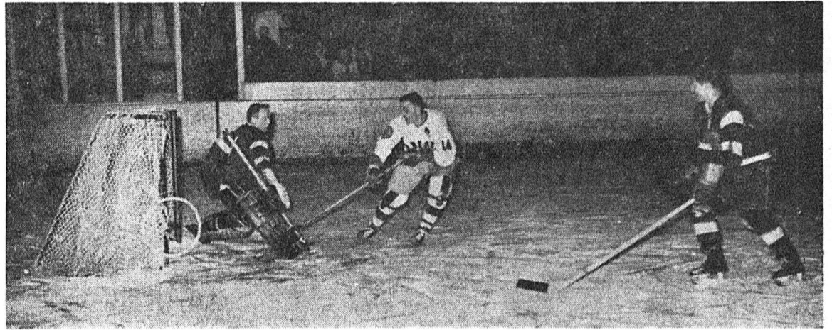
TO ERR IS HUMAN TO FORGIVE . . .