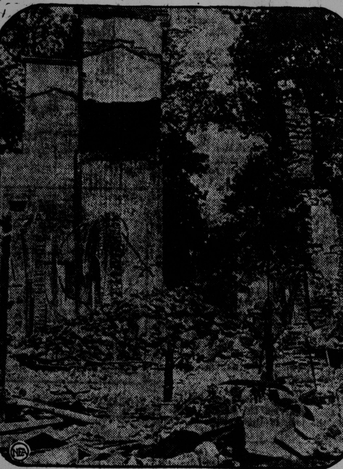
"Ravenworth," ancestral home at Halifax, N.S., to which General Robert E. Lee retired after the Civil War, is a heap of ashes. The irreparable landmark was fired to cover theft of wines and liquors from the basement, authorities believe.