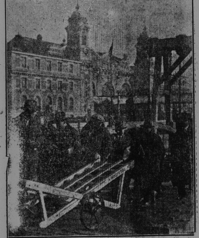
Radicals and agitators of foreign birth who have been arrested arriving at Ellis Island for deportation. The building in the background is the House of Detention.