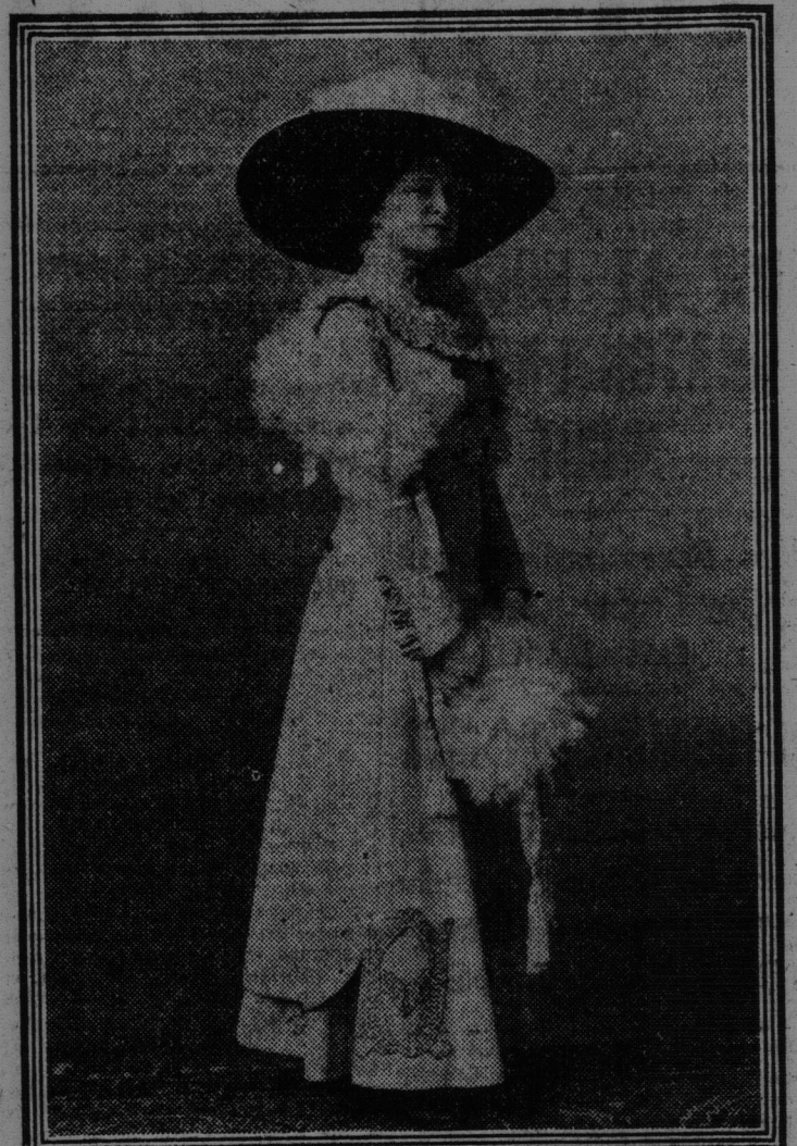
MISSIS MATINEE TOILETTE. Young girls of 16 and 18 years are wearing very attractive afternoon street costumes of light-toned broadcloths. These are of the three-piece variety—that is, a skirt and bodice usually in one piece and a coat of three-quarters or seven-eighths length. This particular costume of oyster white broadcloth has double-breasted flared fronts, which lengthen into ruffled sides and back. Piping and pleating of taupe satin and braiding of taupe soutache ornament the coat and skirt. Harbort neckpiece and muff are attractive accessories.