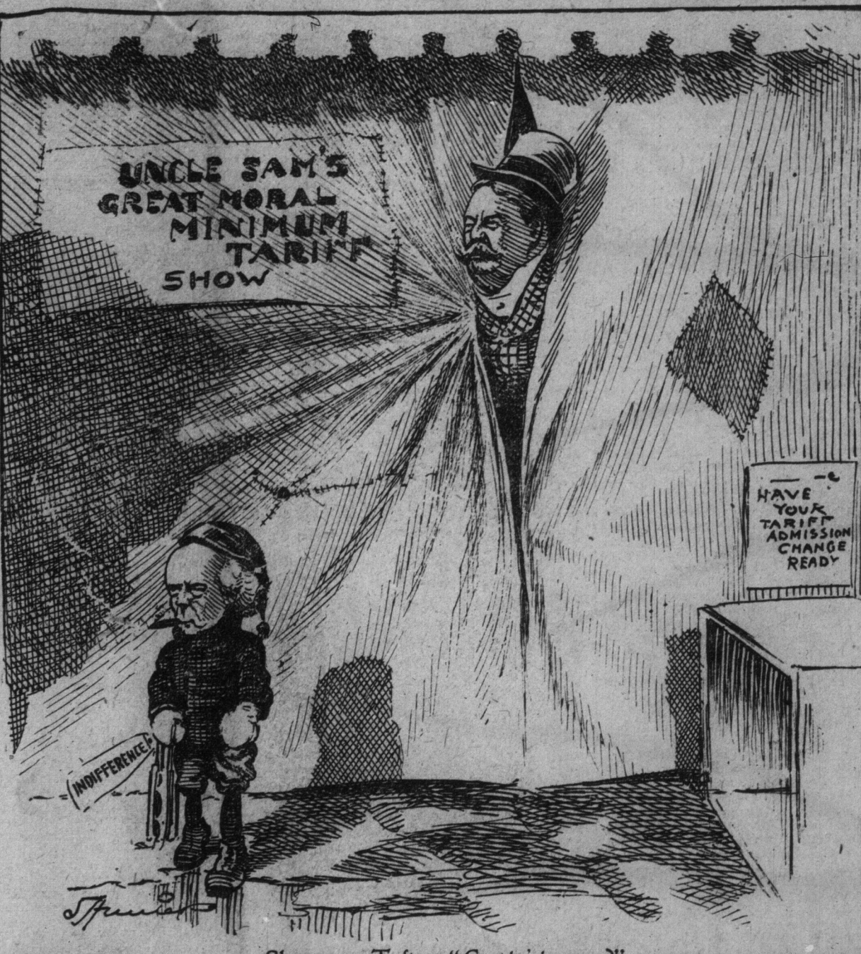
Showman Taft: "Comin' in, son?"