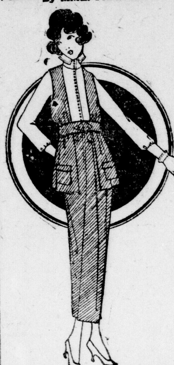
Smart Jumper Frock of Dark Blue Silk Serge With Bodice of White Satin.

Who would wish for wool when wearing a smart frock of silk serge? The material used for this attractive jumper frock is dark blue in color and diagonal in weave. The underbodice is of white satin which buttons high about the neck. Flaring turnovers finish the collar and cuffs. The narrow skirt has a gathered peplum ornamented with patch pockets.